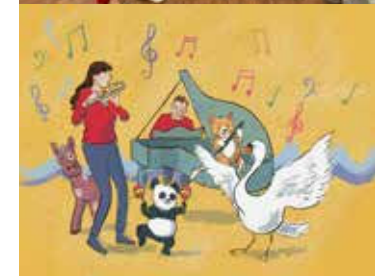
Duo Tutti ▲