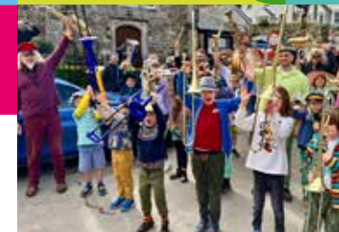
Sounds of the Streets ▼